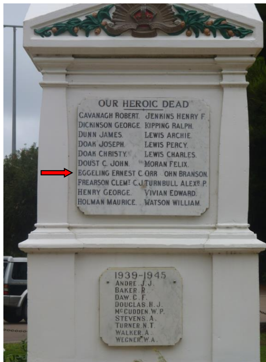
Esperance War Memorial