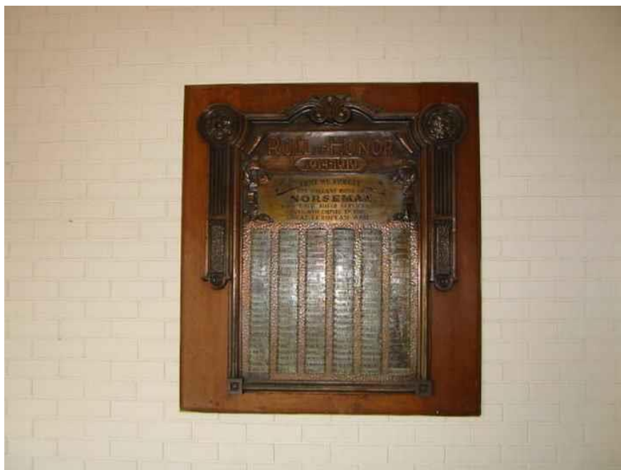
Norseman Roll of Honour