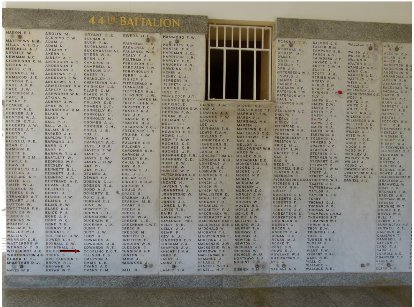
44th Battalion Panel