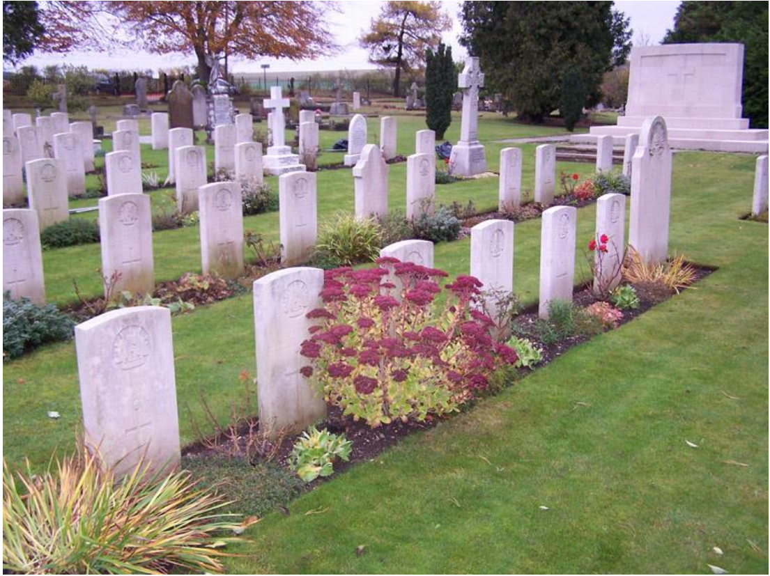
Durrington Cemetery, Wiltshire