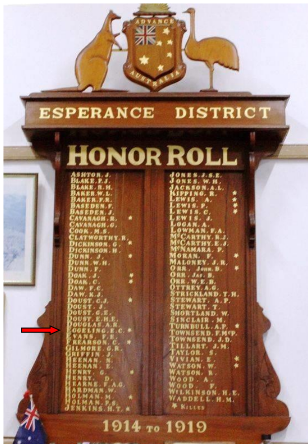
Esperance District Honour Roll

E. C. Eggeling is remembered on the Esperance District Honour Roll, located in RSL Hall, Dempster Street, Esperance, Western Australia.